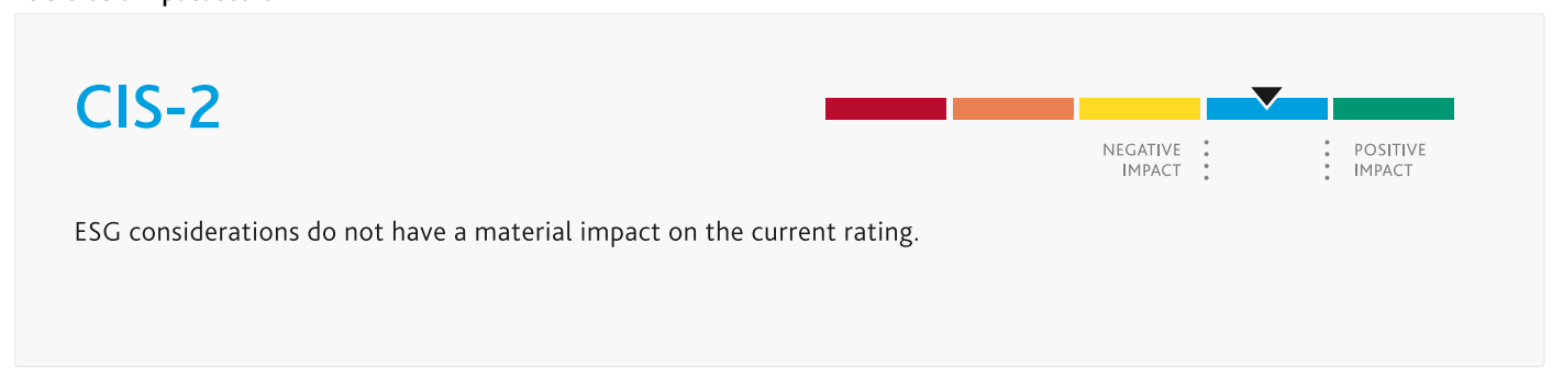
Exhibit 3 ESG credit impact score